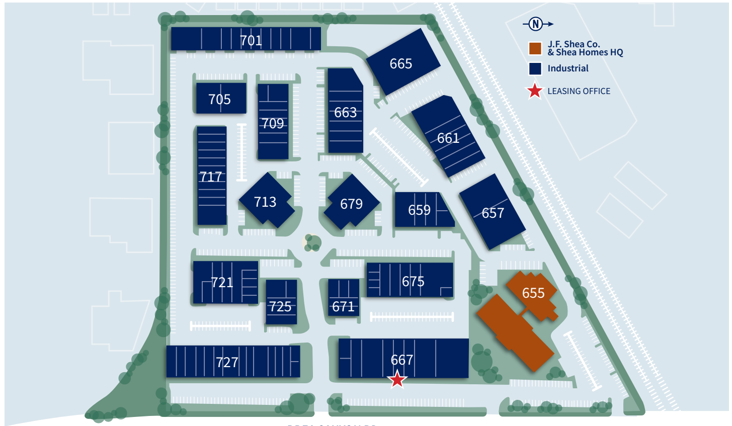
BREA CANYON RD.