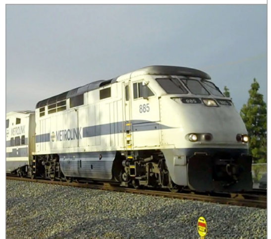
City of Industry Metrolink Station located across the street.

Shea Center Walnut is owned and operated by the 125-year old J.F. Shea Company, with its corporate headquarters right next door. In addition, the leasing office is located on-site for the convenience of our tenants. For more information about Shea Center Walnut and to view a current list of available space, visit SheaProperties.com .