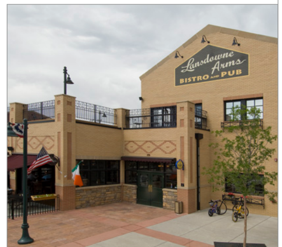
Landsdowne Arms Bistro and Pub

For more information on Highlands Ranch Town Center or any of our other outstanding properties, visit SheaProperties.com .