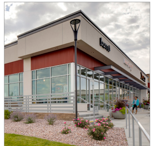
Barre3 at Central Park.

For more information on Central Park or any of our other outstanding properties, visit SheaProperties.com .