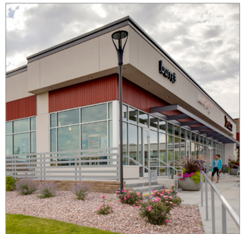
Barre3 at Central Park.

For more information on Central Park or any of our other outstanding properties, visit SheaProperties.com .