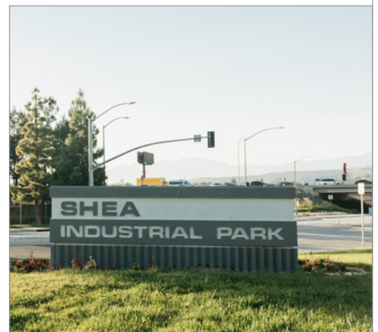
Excellent visibility from Highway 60.

For more about Fairway Industrial Park or any of our other outstanding properties, visit SheaProperties.com .