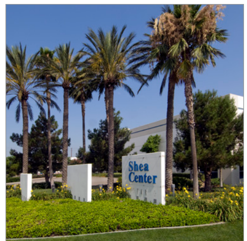
Entrance to Shea Center Ontario

For more information about Shea Center Ontario, or any of our other outstanding properties, please visit SheaProperties.com .